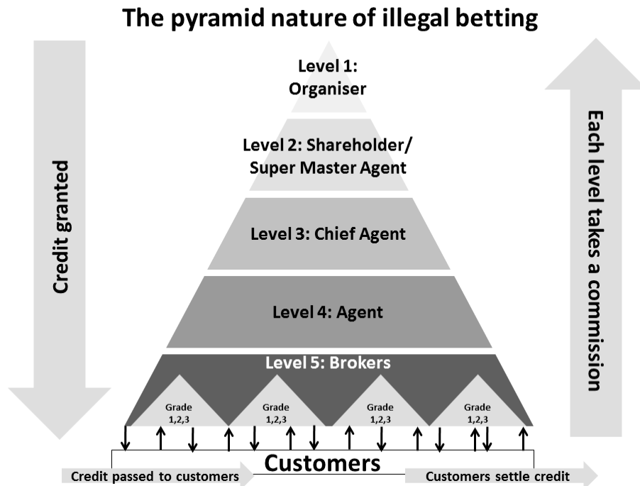
Figure 1 - The pyramid nature of illegal betting

By their nature, illegal betting operations are organised criminal syndicates. This is reflected in the fact that the traditional pyramid structure under which illegal street bookmakers operate as shown below in Figure 1 21 has now been replicated in the internet age, with smaller regional online operators acting as agents / middlemen for the biggest grey-market Asian bookmakers, as shown below in Figure 2.